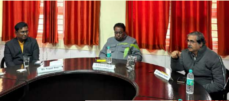
Guest Addressing Students During Review Workshop.