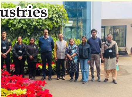
Omega Renk Industries