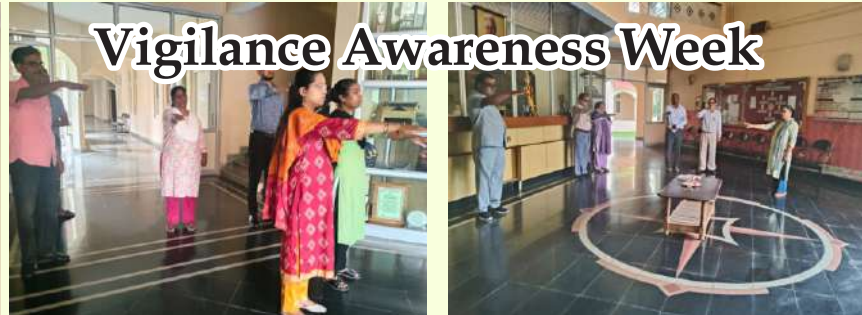
Vigilance Awareness Week