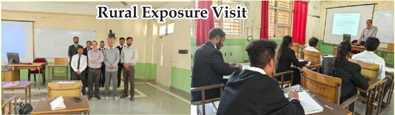
Rural Exposure Visit