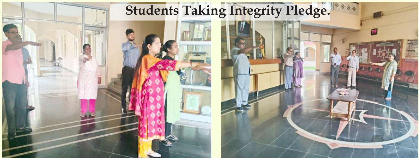
Students Taking Integrity Pledge.

The programme commenced with the Integrity Pledge , where participants reaffirmed their commitment to uphold honesty and ethical conduct in their personal and professional lives. A series of awareness competitions were organized to engage students creatively and encourage discussions on ethical governance and corruption-free practices.